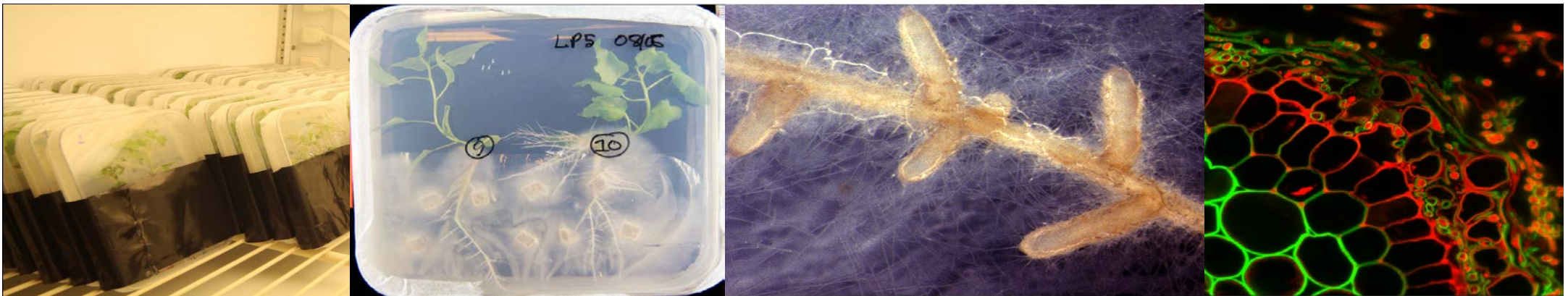
The ectomycorrhizal fungus Laccaria bicolor in an in vitro sandwich culture system by Judith Felten.

Application to participate in the training school should include a motivation and a list of main interests within the topic. The application of no more than one page, should be emailed to benedicte.albrechtsen@umu.se no later than August 25 2018. Later applicants can not be guaranteed consideration if more than ten applicants apply. Financial support (€500) is offered for each of ten participants.